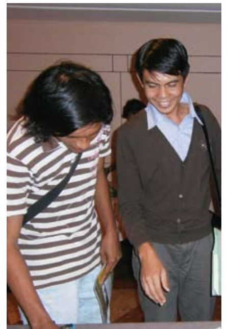
Registration by participants