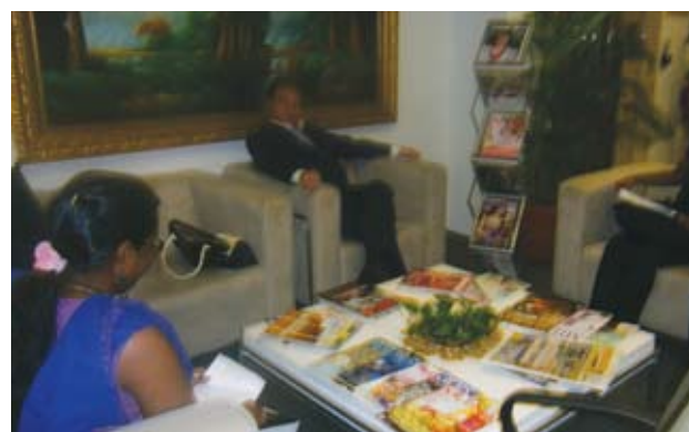
Mr President giving briefing about PCAM