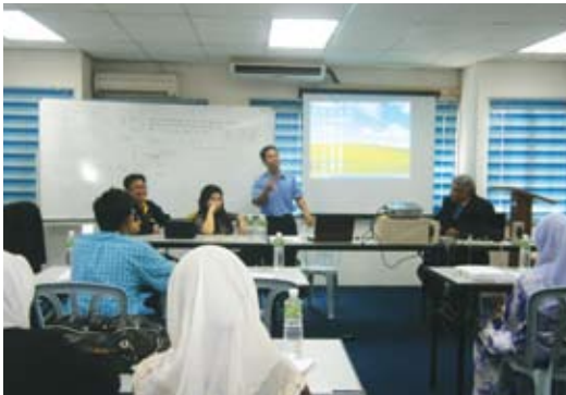
Question and answer session