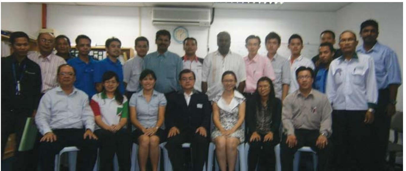
GMP Group photo at 5May 2011