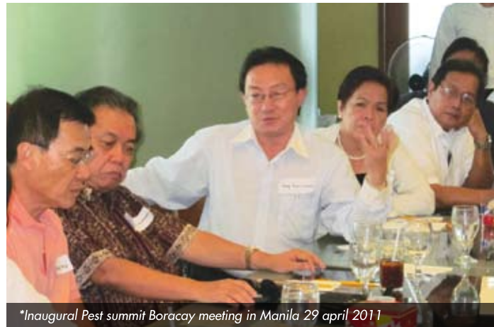
*Inaugural Pest summit Boracay meeting in Manila 29 april 2011

In order to experience firsthand on the rugged but rather adventurous journey from KL to Boracay, we split into 2 groups, with one group flying and overnight in Manila with the next morning another 45 minutes flight to Kalibo international airport and a journey by van of about one and a half hours to the jetty in Caticlan. From Caticlan it was another 15 minutes by ferry to the island of Boracay. Another group of us took a direct flight with Philippines or Cebu Airlines which took off in KLIA at 1am estimated arrival at Manila around 5 am and a transit flight at 8am to Caticlan on a Fokker plane as Caticlan airport caters only for domestic flights only. At this point of writing The Mayor and the Chairman have assured us that come our PS, Caticlan will be converted to an international Airport and hopefully Malaysians will be able to fly directly to this airport, thus saving us valuable traveling time and resources.