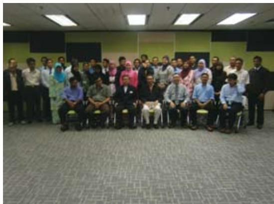
Group photo with PAL Trainer and BERNAS participants