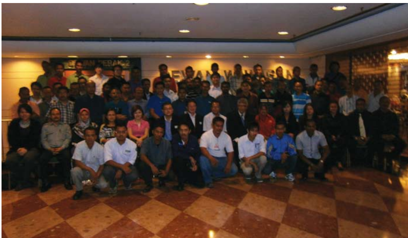
Group photo with 80 participants