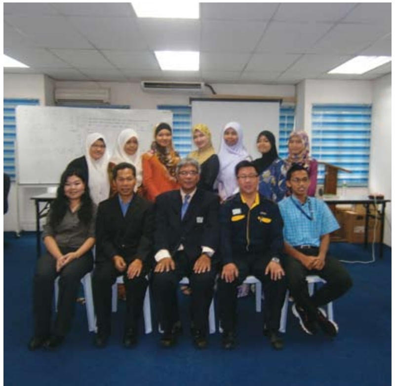
Group photo with PCAM exco