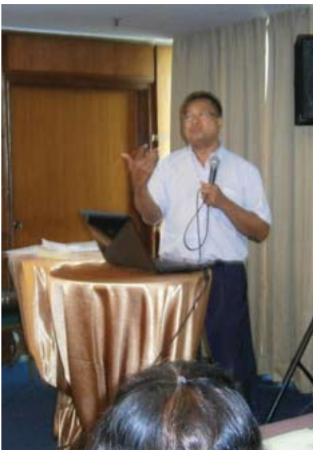
En Sai pol from Agrofog presented on Pesticide usage