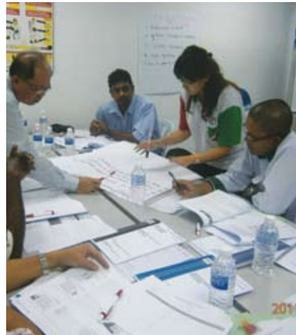
Group A doing their asignments